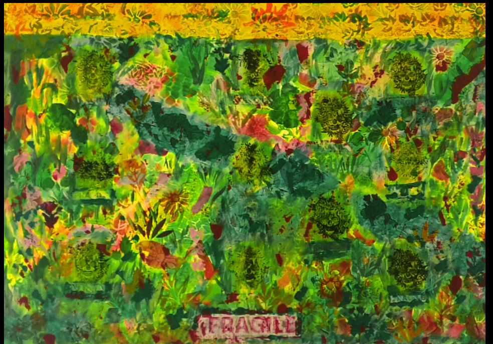
“Toxic Jungle No.2” I